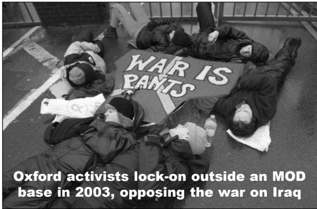
Oxford activists lock-on outside an MOD base in 2003, opposing the war on Iraq

DID YOU KNOW? Most newspapers, TV & radio are owned by mega-corporations whose prime motive is profit. For example, the Oxford Mail & Times are both owned by NewsQuest, who are owned by Gannett, the largest newspaper corporation in the USA.