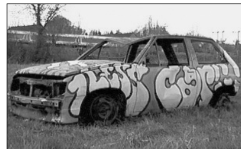
People leave the oddest things just lying around.

You can follow easy instructions and publish your own text and images with just two mouse clicks. Log on to oxford.indymedia.org.uk to join the "free information revolution", bypass the conservative corporate media and become part of a global grassroots network.