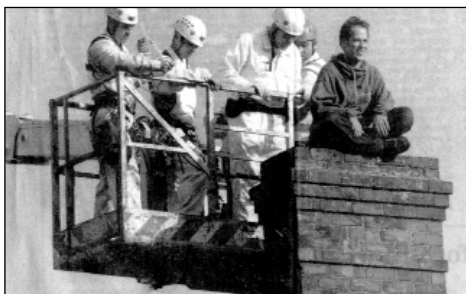
Peaceful resistance to the LMS eviction 1999.

You can follow easy instructions and publish your own text and images with just two mouse clicks. Log on to oxford.indymedia.org.uk to join the "free information revolution", bypass the conservative corporate media and become part of a global grassroots network.